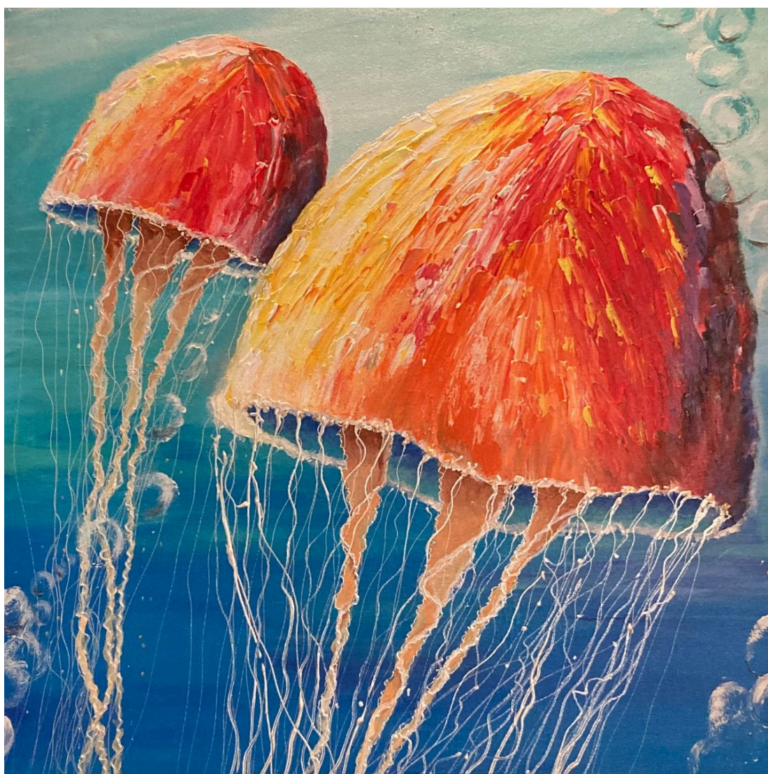
Sue Lawton's Wild Wonders.