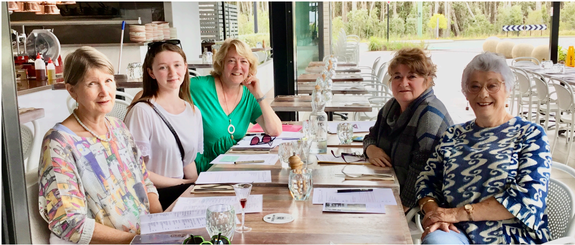
Your dream team at work over lunch!